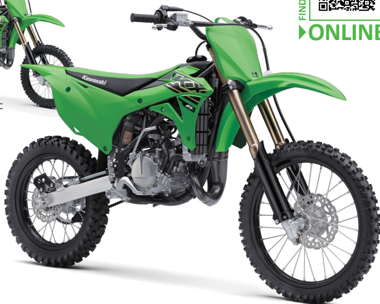
Model Colour: Lime Green | Model Code: KX85D (LARGE WHEEL)