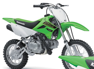
Model Code: KLX110D (LONG TRAVEL SUSPENSION)