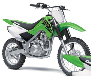
Model Code: KLX140A (SMALL WHEEL)