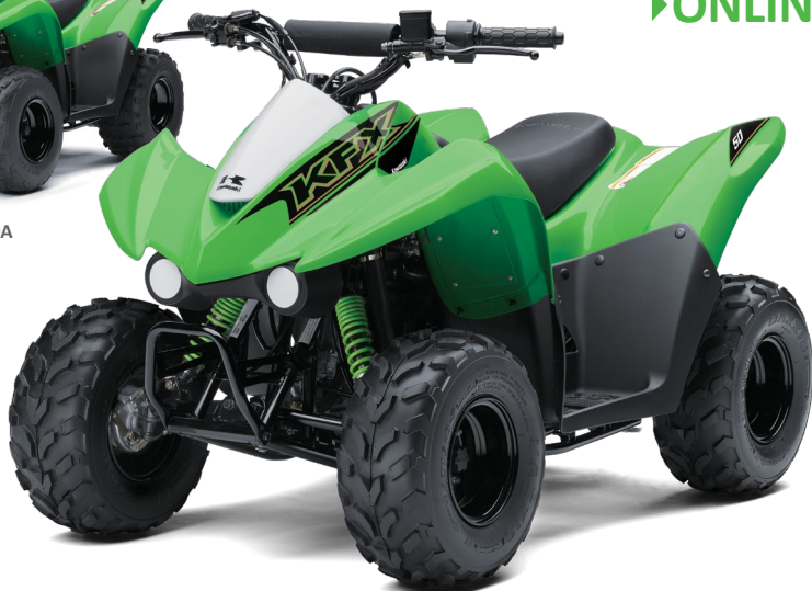
Model Colour: Lime Green | Model Code: KSF50B