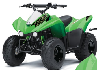
Model Code: KSF90A