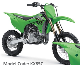
Model Code: KX85C (SMALL WHEEL)